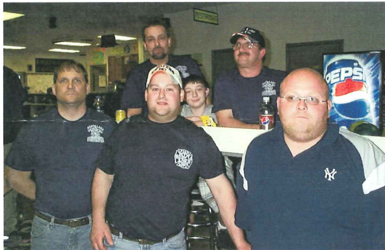
Beach Lake FD not only came ready to bust some pins, but they scored $92 smackers for the 50/50 drawing!