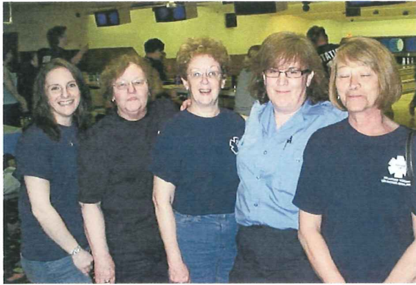
The “undefeated all women” and only EMS team from Delaware Township showed grace and poise under pressure!